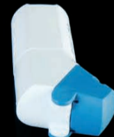
Salbutamol 100 Salamol Easibreath