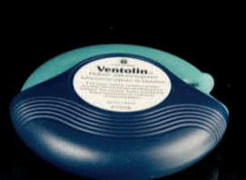
Salbutamol 200 Ventolin Diskus