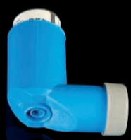
Salbutamol 100 Airomir MDI