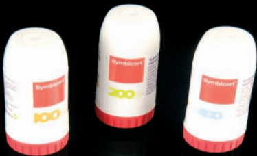
Budesonide/formoterol, 100/6, 200/6, 400/12 Symbicort Turbohaler