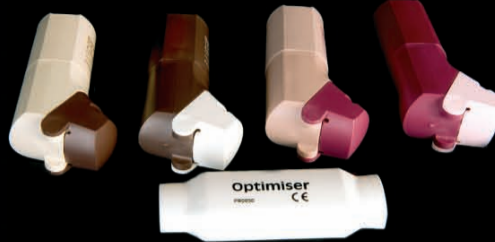
Beclomethasone 50, 100, 200, 250 Beclazone Easibreath with Optimiser