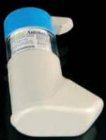
Salbutamol 100 Aerolin Autohaler