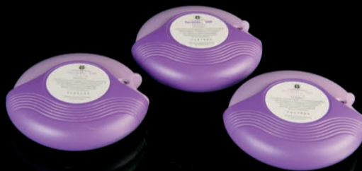
Fluticasone/salmeterol 100/50, 250/50, 500/50 Seretide Diskus