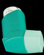
Salmeterol 25 Serevent MDI