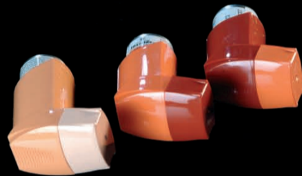
Fluticasone 50, 125, 250 Flixotide Evohaler