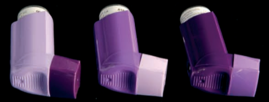
Fluticasone/Salmeterol 50/25, 125/25, 250/25 Seretide Evohaler