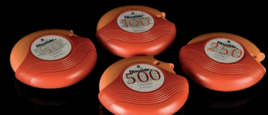
Fluticasone 50, 100, 250, 500 Flixotide Diskus