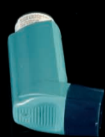
Salbutamol 100 Ventolin Evohaler