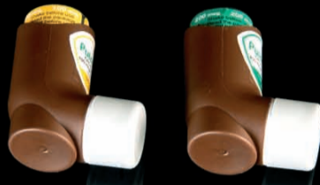
Budesonide 100, 200 Pulmicort MDI