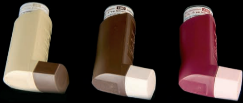
Beclomethasone 50, 100, 250 Becotide Evohaler