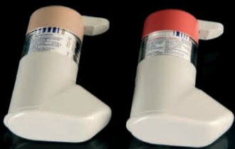
Beclomethasone Autohaler 50,100 QVAR Autohaler