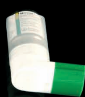
Ipratropium Bromide 20 Atrovent MDI