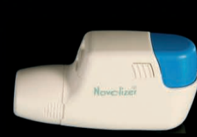
Salbutamol 100 Novolizer Salbutamol