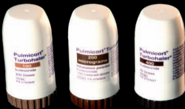
Budesonide 100, 200, 400 Pulmicort Turbohaler