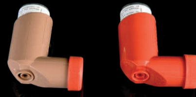
Ciclesonide 80, 160, Alvesco