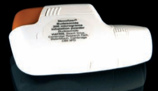
Budesonide 200 Budesonide Novalizer